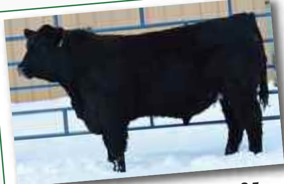
Roth Wayon 649 - Lot 25

This sale will be broadcast live on the internet. DVAuction Broadcasting Real-Time Auctions. Real time bidding & proxy bidding available. No questions asked. Ask for it! (800) 776-5275 - www.dvauction.com