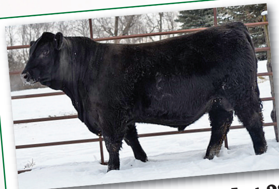
Roth Active Duty 516 - Lot 22

This sale will be broadcast live on the internet.