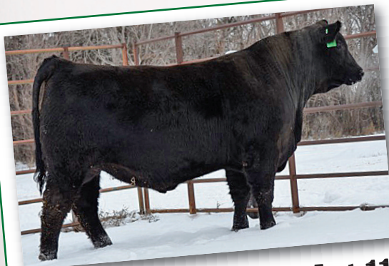
Roth War Party 523 - Lot 11

FRIDAY, MARCH 25, 2016 4:00 PM • AT THE RANCH