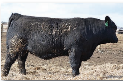
Roth Cash 539 - Lot 5