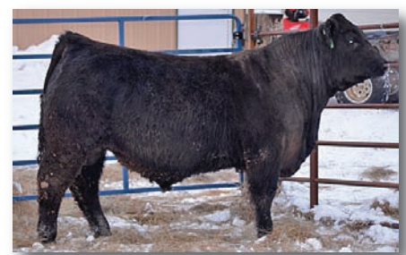
Roth Conversion 527 - Lot 35