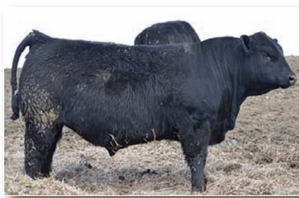
Roth Active Duty - Lot 25