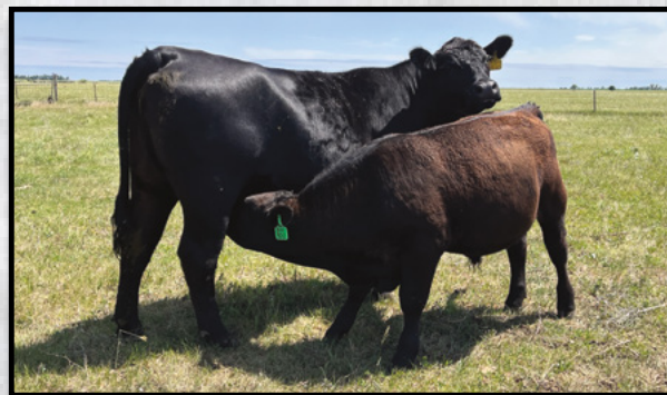
Lot 9 in the middle of June.

A long-bodied, clean-made bull that's athletic on the move and built right from the ground up. Out of a first-calf heifer, he blends balance and stretch with real-world functionality. Ranking in the top 4% of the breed for calving ease, top 3% for weaning weight, and top 2% for yearling weight, he offers the rare combination of sleep-easy calving and elite growth. Proof that calving ease and real growth can live in the same bull. A quiet, confidence-building option for first-calf heifers.