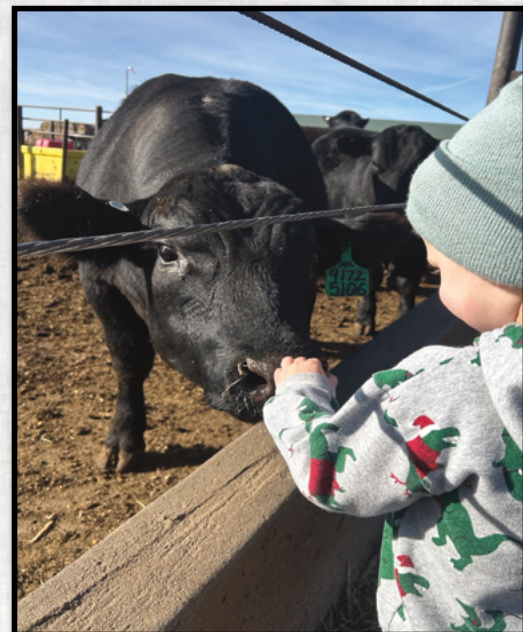
Lot 55 Getting his daily scratches from Stetson.

Deep-bodied and square-made with a strong top and plenty of base width. He's built with natural thickness and the kind of structure that holds up over time. Designed to sire steady growth and cattle that stay sound and productive, he fits programs focused on consistency and durability. A dependable Guard Rail bull that helps keep a calf crop uniform.